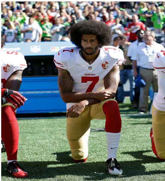
Colin Kaepernick , Crusader of Blacks Against Police Brutality