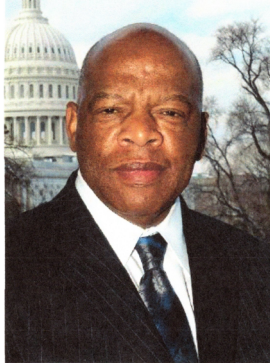
John Robert Lewis (February 21, 1940 – July 17, 2020)