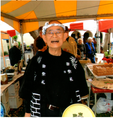
Selling pottery at Pilgrim Place Festival