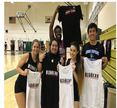
Key Basketball, Volleyball Tournaments

(Supporting role of Little Tokyo Service Center led by Bill Watanabe)