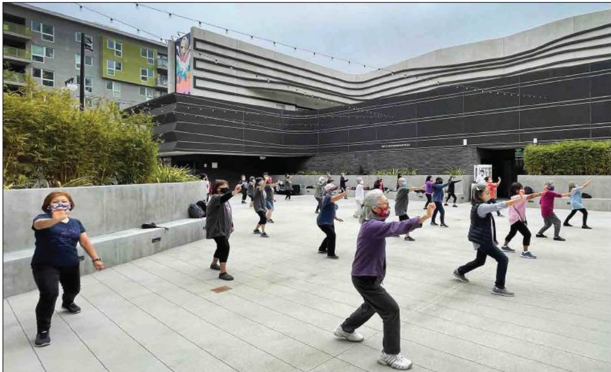
Tai Chi at Terasaki Budokan, Little Tokyo