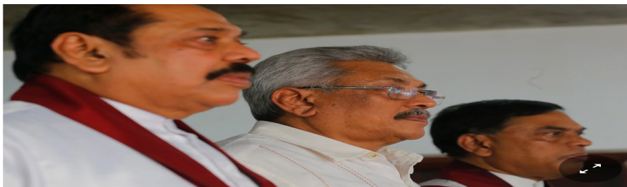
From left, Mahinda Rajapaksa, Gotabaya Rajapaksa and Basil Rajapaksa in 2018. The family has dominated Sri Lanka for the better part of two decades.

* Sri Lanka : Ranil Wickremesinghe is the new prime minister of Sri Lanka. The ruling Rajapaksa family dynasty had brought economic collapse worse than the three-decade-long civil war that ended in 2009. Key Rajapaksa officials are in hiding in a military base. The island nation is in desperate need of gasoline. NYTimes, Mujib Mashal, 5/17/22. The cruel 30-year civil war was majority Sinhalese Buddhists defeating minority Tamil Hindus. The social message of Buddhism in India is liberation from the caste system. But sadly the Sinhalese Buddhist majority in Sri Lanka maintains the caste system.