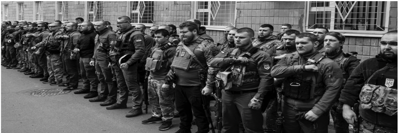
Members of the Azov brigade line up for a funeral for two of their fellow soldiers in the courtyard of Kharkiv Regional Hospital.

* 1,700 Ukrainian troops holding out in Mariupol Azovstal Steel Plant surrendered to Russian troops, taken custody to Russian controlled Ukrainian territory.