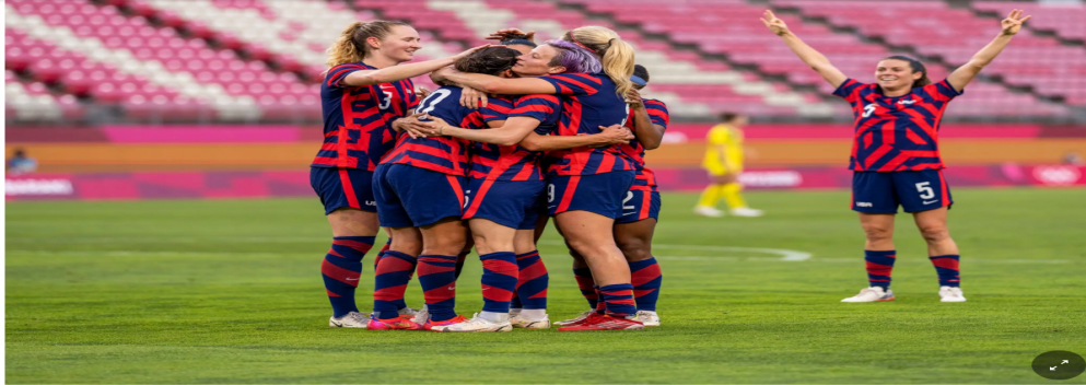
The United States women won a World Cup championship and an Olympic bronze medal during their six-year fight for equal pay.

*The US Women's Soccer Team won their 6-year fight for equal pay to the men's team. The women had won the last two Women's World Cups and four overall.