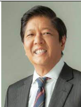
Ferdinand BongBong Marcos, Jr.

*New Philippine President and Vice President: Ferdinand Marcos, Jr. and Sara Duterte are the President and Vice President elect. Associated Press, L A Times, 6/21/22. Perhaps we are too familiar with both family names?