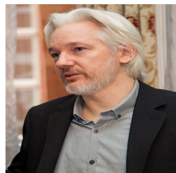
Assange in 2014

Now a new thing--even losing face to our Supreme Court and January 6th insurrection! Are we really criminalizing the heroic whistleblower, Julian Assange of WikiLeaks, who exposed U.S. war crimes in Iraq and Afghanistan? Is there no protection for journalists to expose government crimes? Are we really no better morally than banana republics?