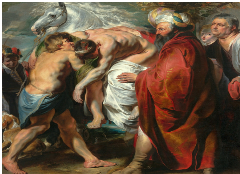
The Good Samaritan by Jacob Jordaens , c. 1616

Jews are described as God's special people with true religion. But Samaritans were criticized as mixed race and wrong religion. A Samaritan was riding a donkey on a lonely road and guess what, he found a Jew lying on the roadside beaten by robbers and half dead. Why should a Samaritan help a Jew? Jews hated Samaritans. But the Samaritan put the Jew on his donkey, bringing him to an inn where he paid them to nurse the injured man. God accepted this Samaritan because he showed love for this helpless man.