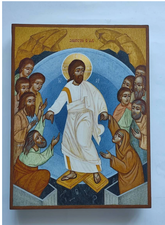
Jesus Releasing Prisoners of Hell

#3 Existential Christianity (Søren Kierkegaard). Many churches baptize infants. That displays the faith of the parents, of course, not the faith of infants. At about age 13 the child attends confirmation classes where church teachings are explained. When the child passes a paper test, giving right answers to religious questions, the child is " confirmed " in the faith of the parents. But as European state churches show, this smooth process produces " folk religion " focused on religious conformity of the masses with few radical conversion experiences of individuals. Both Christianity and Buddhism at the core are religions of radical conversion experiences --"born again Christianity" and "enlightenment Buddhism."