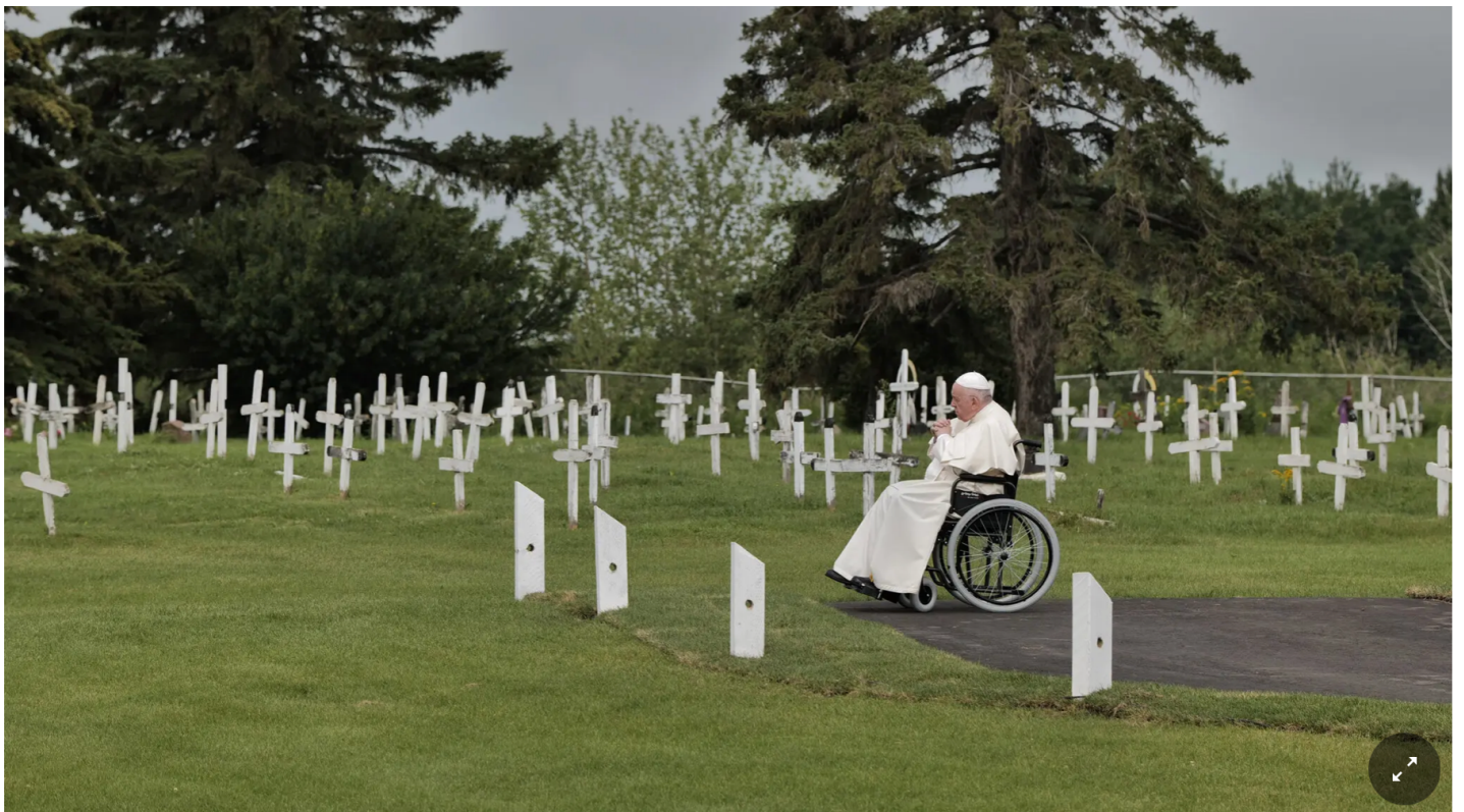
Pope Francis visited a cemetery in Maskwacis, Alberta, where local Indigenous people believe children were buried in unmarked graves.