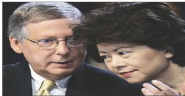
Mitch McConnell and Elaine Chao in 2013.